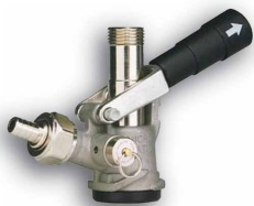
Sankey D coupler

This wine pairs well with Mexican Carnitas tacos (barbecued pork) spiced with cardamom and spicy chiles served with salsa fresca. It's great with anything off the grill from Tri-tip to chops to filet mignon and for vegetarians go for an impossible burger made with grains and/or mushrooms.