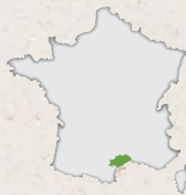
Pays d'Herault, France

Managed by a dynamic father-daughter duo, it's grown at a single domaine in the Herault region, just outside Béziers and steps from the Mediterranean Sea. The family converted the domaine to organic viticulture in 1999 and now the vineyards thrive from this forward thinking approach. The style of their Chardonnay is medium-spectrum, produced to suit a wide range of Chardonnay drinkers from those who enjoy a bit of oak as well as those that look for fruit and acidity.