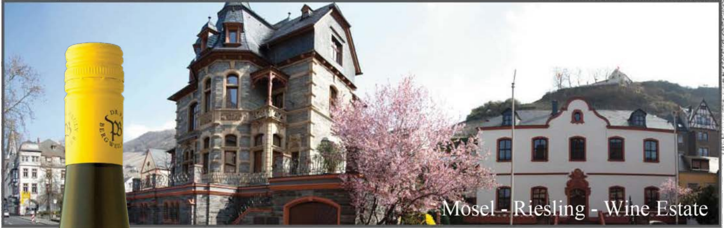
Mosel - Riesling - Wine Estate