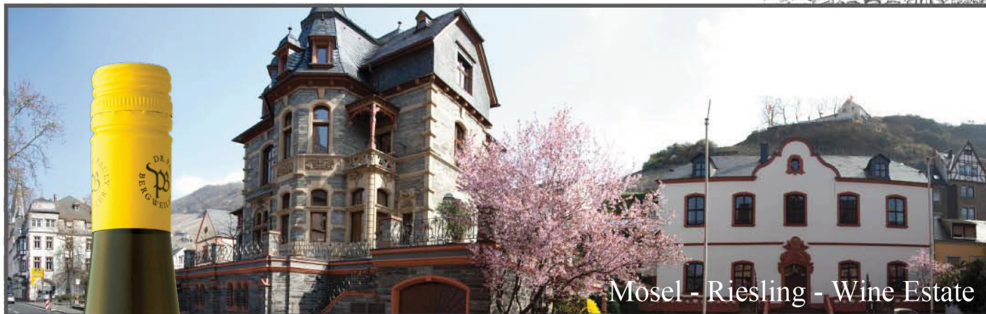
Mosel - Riesling - Wine Estate